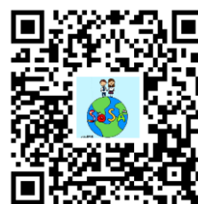
International Programs Website